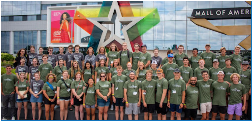
All our guests and Gray Ducks outside MOA before the scavenger hunt.