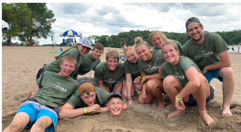
The Montana church team enjoys Bush Lake Beach.

ThereforeGo Ministries gave us a very positive review so we are hosting again from July 29-August 5, 2023. We are hoping to fill up to 60 participants next summer! There will be plenty of ways to help out and you will hear more about it when the time comes.