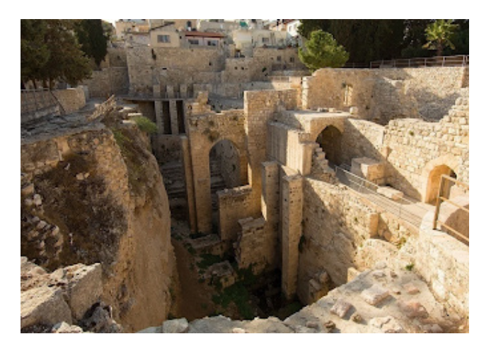
Pool of Bethesda with five porticos or archways