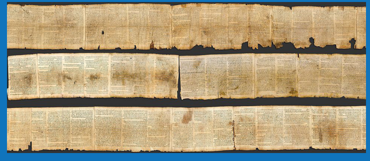
The Great Isaiah Scroll